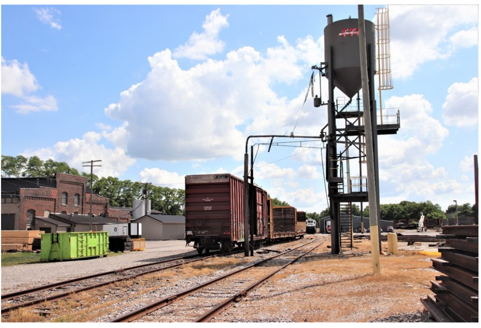
September 2023 BLUEGRASS RAILROADER PAGE 6

The Paris Yard, showing the sand tower still proudly bearing the "TTI" logo